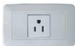
EXAMPLE OF SINGLE SOCKET WALL