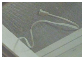
EXAMPLE OF SINGLE SOCKET CEILING